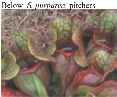
Below: S. purpurea pitchers