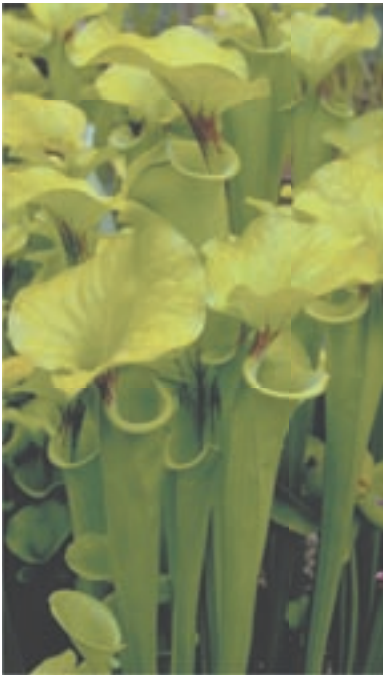
Above: S. flava pitchers (leaves)